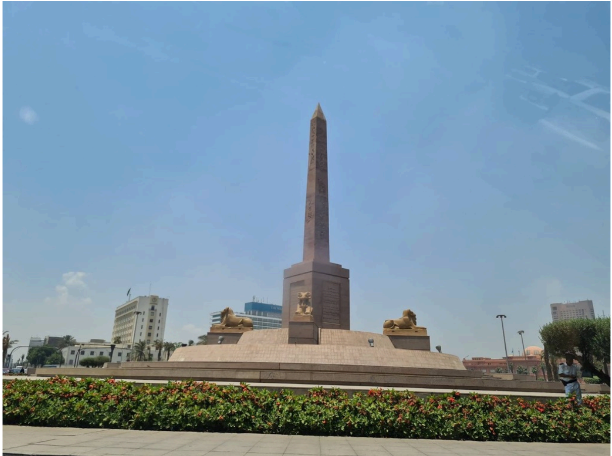
The Obelisk and four rams taken out of their original archaeological site to imitate European Squares