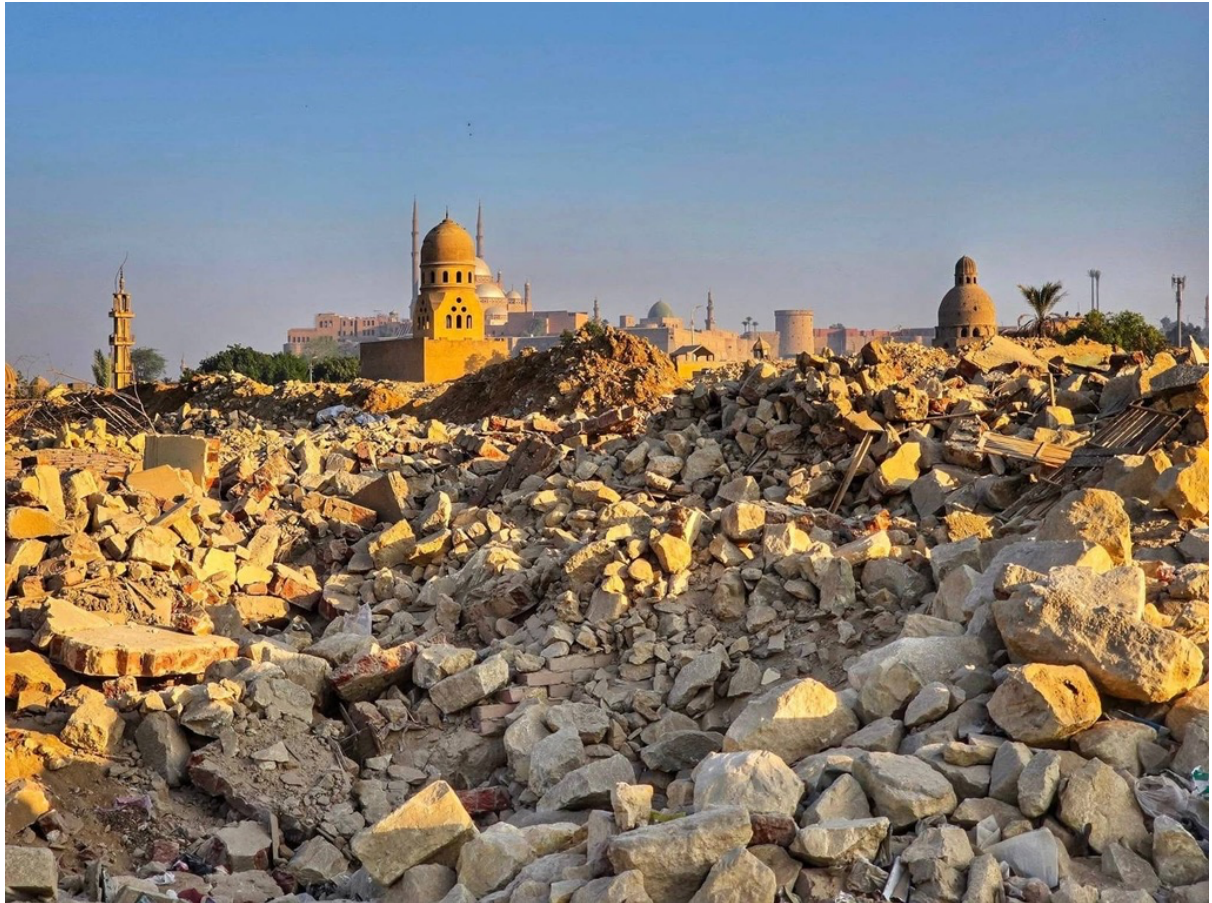
The Destruction of the Cairo Cemetery