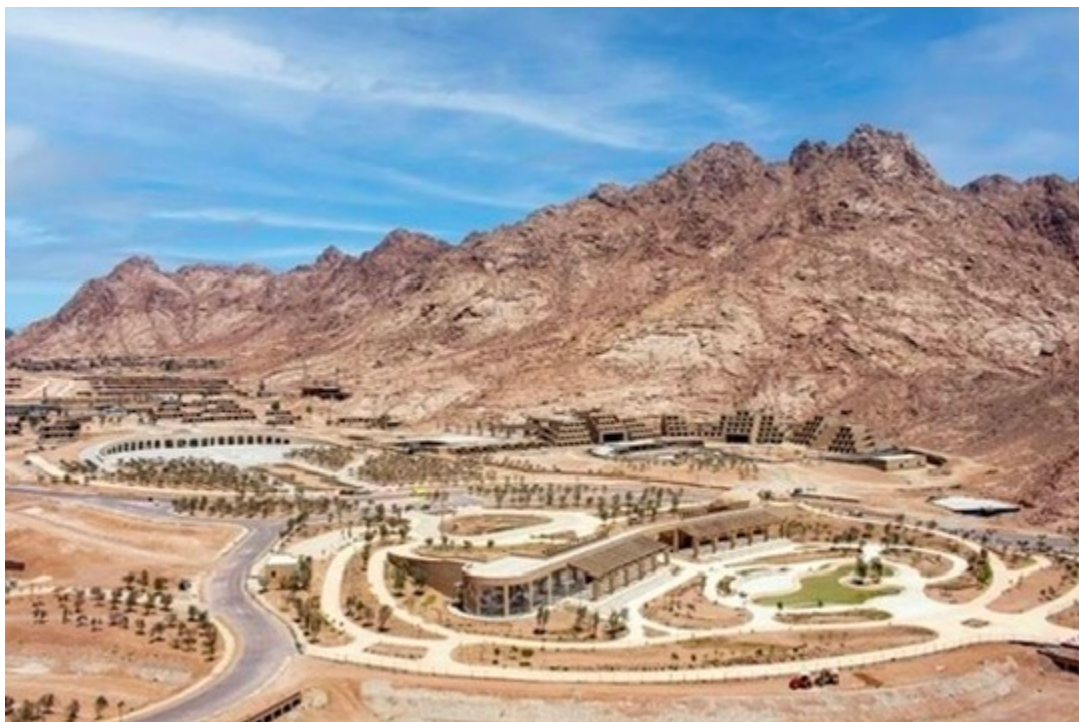
The Unplanned Development at St. Katherine's