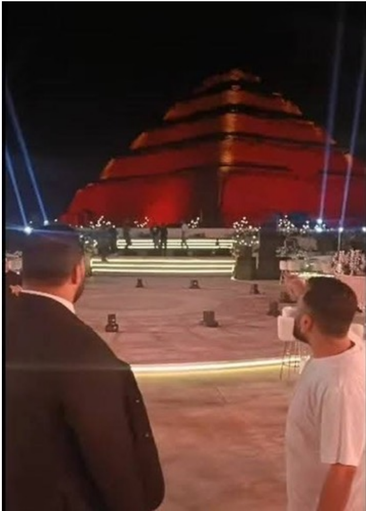
The Weddings and Private parties on top of the 23 rd -26 th Dynasty Tombs