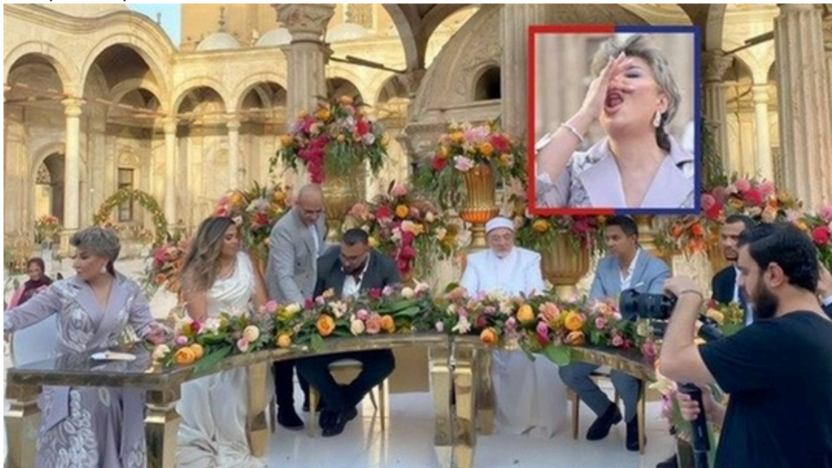
The wedding Halls at Mohamed Ali's Mosque